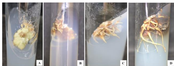
Figure 2: Various stages of mini rhizomes and root initiation in MS media supplemented with 2.5 mg/l Kn from callus.