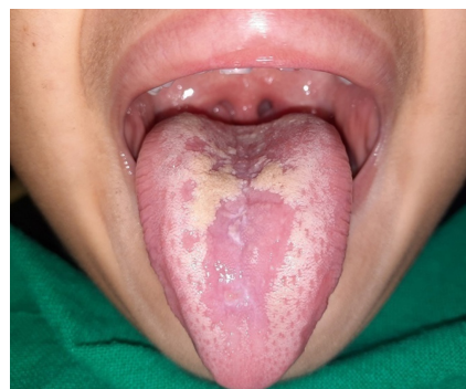
Figure 5. One month follow-up.