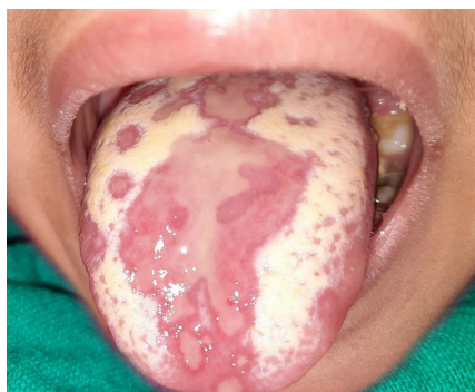
Figure 3. Tongue 48 hours after starting the use of 0.15% w/v benzydamine hydrochloride solution.

The patient was instructed to rinse with 15 ml of 0.15% w/v benzydamine hydrochloride solution upto four times per day for 15 days by holding for at least 30 seconds and then expelling from the mouth. The symptoms were relieved within 48 hours (Figure 3,4). The patient was also advised to take soft bland diet and maintain oral hygiene. Though there was complete resolution of symptoms after 15 days, even without the intake of any medications, the whitish coating on the tongue was persistent till one-month follow-up (Figure 5) and patches of depapillation were still seen in two and three months follow-up (Figure 6,7).