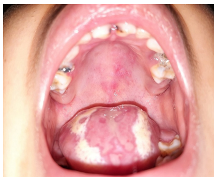
Figure 4. Hard palate 48 hours after starting the use of 0.15% w/v benzydamine hydrochloride solution.