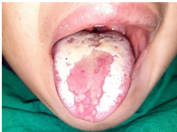
Figure 1. White non-scrapable coating with multiple ulcers on dorsal surface of tongue.