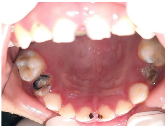
Figure 2. Multiple coalesced ulcers of varying sizes on hard palate.

A routine blood investigation, peripheral smear and serological tests were done along with an overall examination of the child by a Pediatrician. On laboratory investigations, erythrocyte sedimentation rate (ESR) was elevated, C-reactive protein (CRP) was high and white blood cell (WBC) count was increased. Exfoliative cytology was performed, cytological smear prepared and Periodic-Acid-Schiff (PAS) staining was done which showed bacterial cocci with no presence of fungal hyphae. The serology test for Human Immunodeficiency Virus (HIV) was negative.