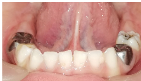
Figure 6. Six months follow-up photograph.