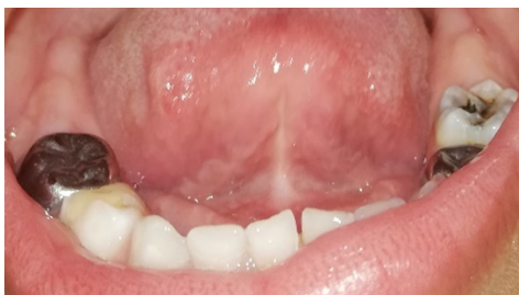
Figure 5. One week follow-up intraoral photograph.