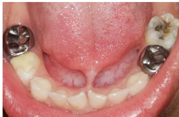
Figure 1. Pre-operative intraoral photograph.

Extraoral examination showed no significant findings. On intraoral examination the patient had limited tongue mobility and prominent lingual frenum. When the patient was asked to protrude the tongue, slight blanching was seen on lingual aspect of the lower anterior teeth (Figure 1). The patient was unable to pronounce the words starting with letters "t", "d", "l", "th" and "s". The range of tongue