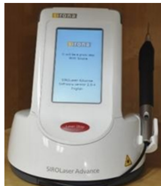
Figure 3. Sirona DiodeLASER.