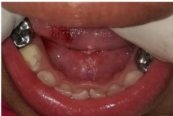
Figure 2. Immediate Post-operative intraoral photograph.