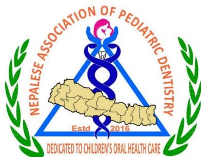
Figure 1. The logo of NAPD.