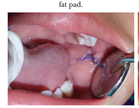
Figure 4. Satisfactory healing after one week.