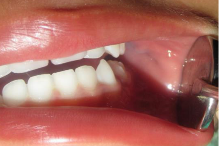
Figure 5. Four months follow up showing complete healing.