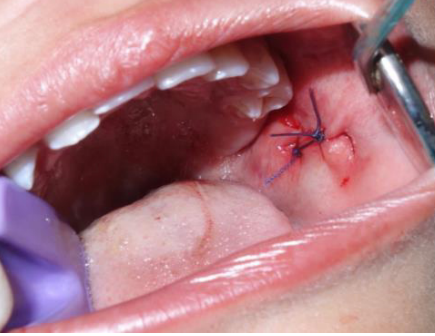
Figure 2. Excision and primary closure (vicryl suture).