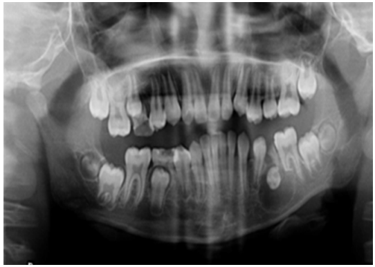
Figure 3. OPG showing horizontally impacted 35