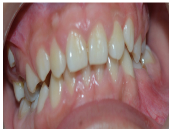
Figure 2. Preoperative - Expansion of buccal cortical plate (74, 75).