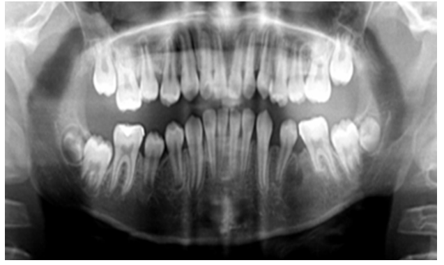
Figure 11. OPG after three months.