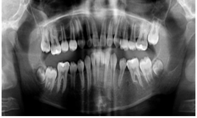
Figure 12. OPG after nine months.

Orthopantomogram (OPG) revealed a well-defined unilocular radiolucency extending from the apical third of root of 75, surrounding the impacted left second premolar (35) which was displaced buccolingually (Figure 3). Intraoral periapical radiograph (IOPAR) revealed dilaceration of the mesial root of 36 (Figure 4).