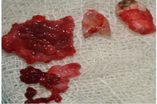
Figure 6. Enucleated cystic mass and extracted 75 and 35.