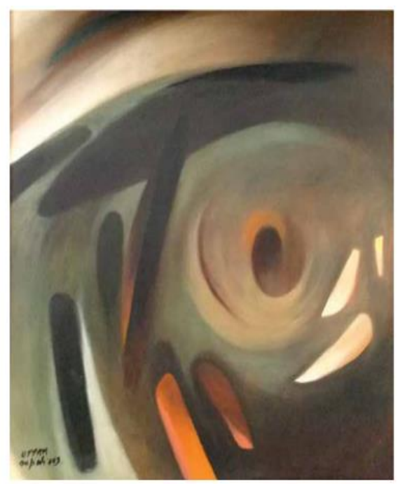
Fig. 6 Uttam Nepali. The Vision, 2003, Acrylic on canvas

This Untitled(fig.5) painting has beauty without any objective representation of natural world. It is painted in yellow, red and olive green color. The yellow circular patches show the warmth and happiness. The circular surface is disrupted by many whimsical lines. These lines show the intense force which overwhelmed the artist while making this painting. His lines are corresponding to the circular shape created by yellow and green transparent patches. This correspondence has their own existence in the pictorial language to create beauty.