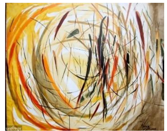
Fig. 5 Untitled [Source: Uttam Nepali, 2000, Acrylic on canvas]

Nepali's another painting Untitled (Fig.4) is bright and cheerful. This abstract painting did not rely on motifs drawn from the natural world. The beautiful patches of brilliant red and black float freely on light color. He wanted the contrast of the bright free-flowing colors and the scratchy lines to stir the viewer's emotion directly. Here the colors came through chance which the artist normally attempted to control in his previous painting. In his exhibition catalogue, Nepali (1997) himself states that "where there is the state of moral creativeness, there is the creation of pleasurable mental environment". Hence he is able to create pleasurable environment.