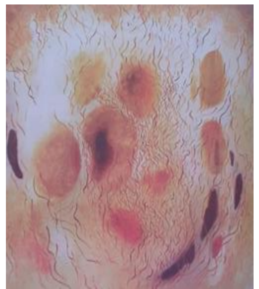
Fig.9 Uttam Nepali. Untitled, 2007, Acrylic on canvas

ISSN 2795-1774 (Print), 2795-1782 (Online)