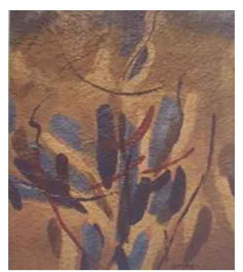
Fig.7 Uttam Nepali Untitled., 2003, Acrylic on Handmade Paper, 24"x30"

ISSN 2795-1774 (Print), 2795-1782 (Online)