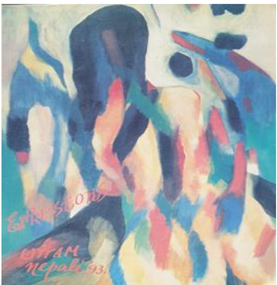
Fig. 3 Expression [Source: Uttam Nepali, 1993, Acrylicon canvas]

Fig. 2 Uttam Nepali. Meditation , Poster Color, 74 x 58 cm, MoNA Collection The painting Meditation (Fig. 2) arouses the tranquil feeling as Nepali uses cool green and blue colors. Thin red patches come against his cool palate. The mature knowledge of complementary colors developed inside the unconscious mind of an artist can be measured through this painting. One can find the feeling of meditation by observing it. It works like the armchair for the viewer to relax after the hard work. Sometimes, it looks like the distorted form of face with closed eyes. Yellow is representing eyes then immediately the form changes into the form of tree or jungle in front of our eyes. The big area of lemon yellow on the top most part of the painting is balanced by the small form of yellow given in the lower part against flat black planes. This pictorial language proves that there is no need of representation of objective world to communicate joyous feelings.