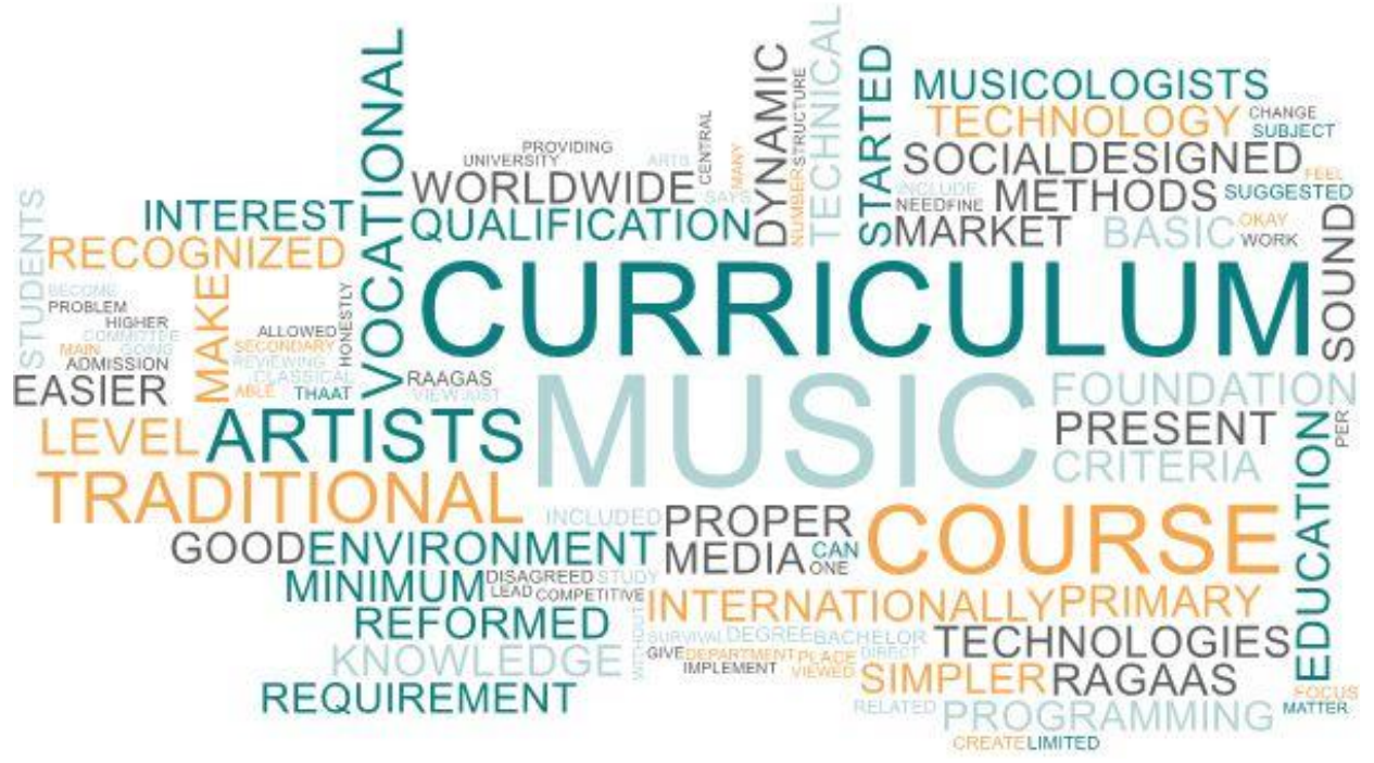
Figure 1 Views of academicians towards curriculum

Respondent 20 stressed that 'The present curriculum has not been structured after observing the level and status of the students. The designers of the course include the topic whatever they know about the music and the students are compelled to follow that. I totally disagree'. Respondent 22 says in his words 'We are still in traditional system but we have to do advance work in this field and we should create a new music Faculty. Then we can do lots of things related to the curriculum'.