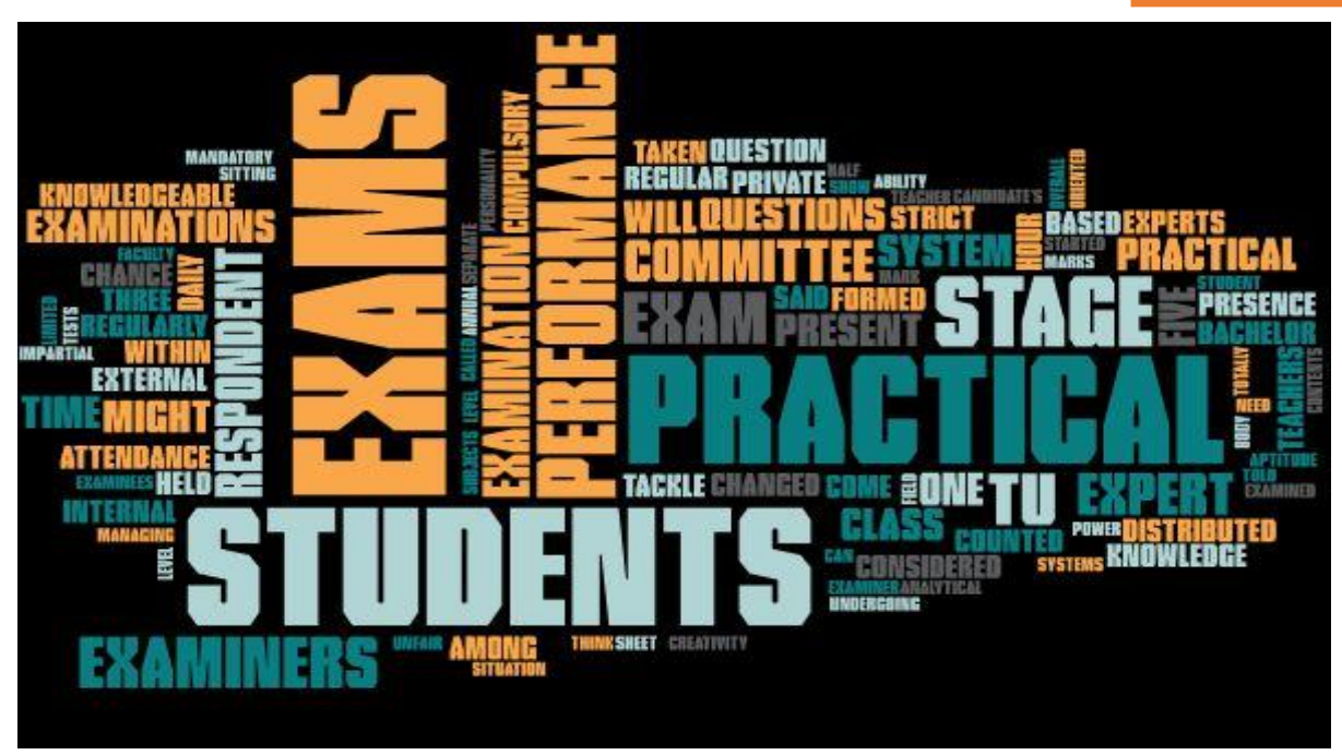
Figure 3 Views of academicians towards examination system