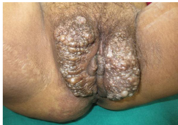
Figure 1: Swelling over the genitalia studded with multiple vesicles and bullae

Patient had swelling over the vulva studded with blisters associated with itching since one year. The swelling had been gradually increasing for one year; however, there had been faster increase since the onset of pregnancy. This patient also had a large irregularly shaped erythematous macule with well-defined margins, extending from the right perineal region to the right buttock and lower back crossing the midline, since birth. She denied any history of trauma, surgery, infections, cancer or radiation therapy in the area. On examination, there was hypertrophy of the vulvae with warty sessile growths and vesicles over the involved area (Fig. 1).