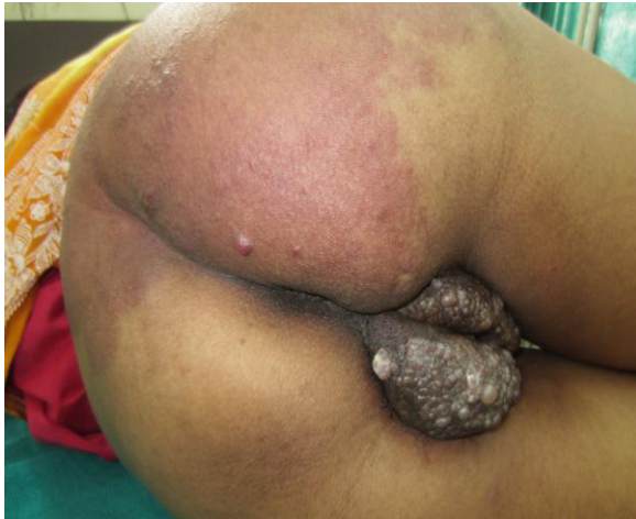
Figure 2: Large well to ill-defined erythematous macule on the right buttock extending up to the thigh.

In addition, there was a large irregularly shaped erythematous macule with well-defined margins, extending from the right perineal region to the right buttock and lower back crossing the midline (Fig. 2).