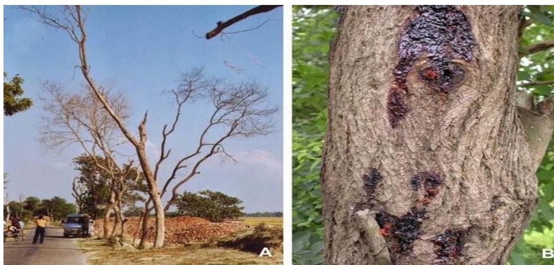
Fig.5. D. sissoo showing symptoms of dieback. A. Adversely affected trees with stag head. B. Black spots on the bark (Muehlbach et al. , 2010).

One of the most significant diseases is called dieback wilt by F. Solani f. Sp. Dalbergiae is eclipsed in Dalbergia sissoo . The dieback is distinguished by thinning leaves and crowns in extreme conditions, drying of ends of branches, roofing of table, and a stag-head (Khan & Khan, 2000). In the acropetal succession, the entire tree looks yellow, as shisham wilts yellowing and death of leaves occurs. The infected trees display symptoms of wilting, the leaf shed makes the branches clear in the advanced stages, and plants will eventually die in a few months (Kumar & Khurana, 2016). It can take one month to a year to fully die the tree from above; the tree begins to die from above (Parajuli et al. , 1999).