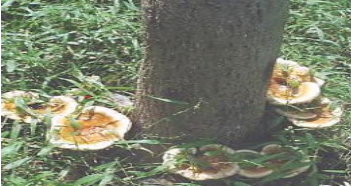
Fig.3. Fruiting bodies of G. lucidum causing root rot in D. sissoo (Bhatia, 2015).

Disease prevention was tested by the treatment of fungicidal seeds and soil alteration with crop residues. The prevention of disease is found with highest percentage of bavistin and