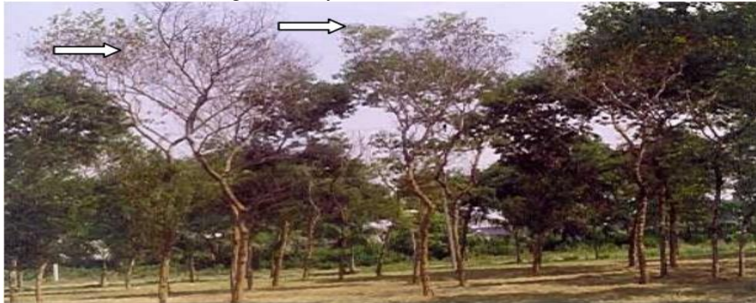
Fig.4. Wilting of shisham tree