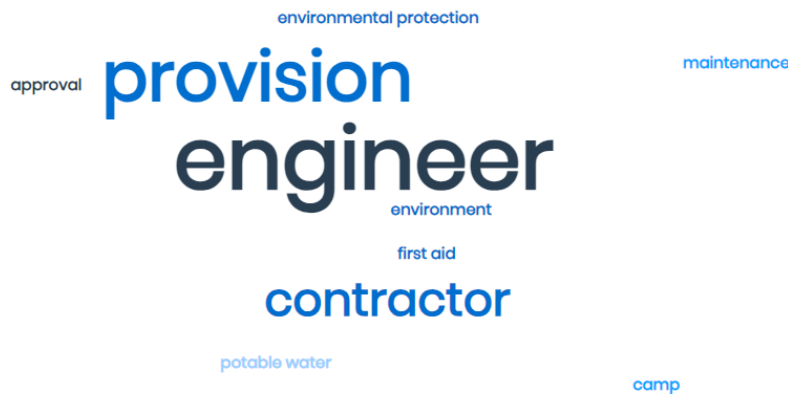
Figure 3. World cloud of ADB's project under study on Environmental protection, health, and safety Provisions