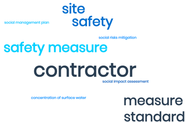
Figure 4. World cloud of KfW's project under study on Environmental protection, health, and safety Provisions