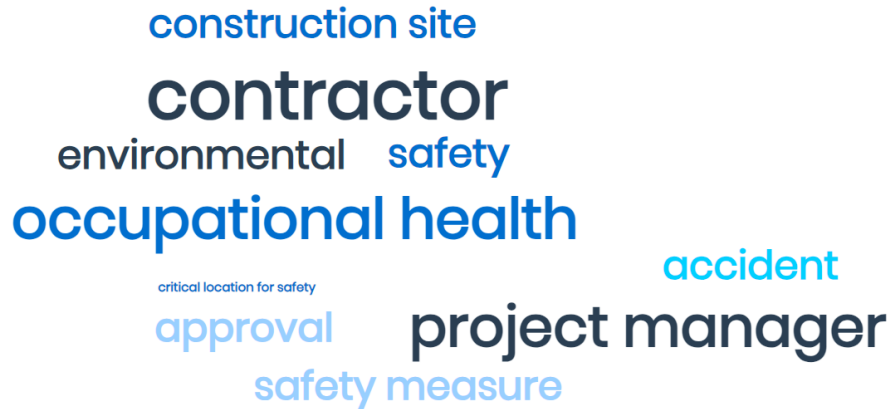
Figure 2. World cloud of WB's project under study on Environmental protection, health, and safety Provisions