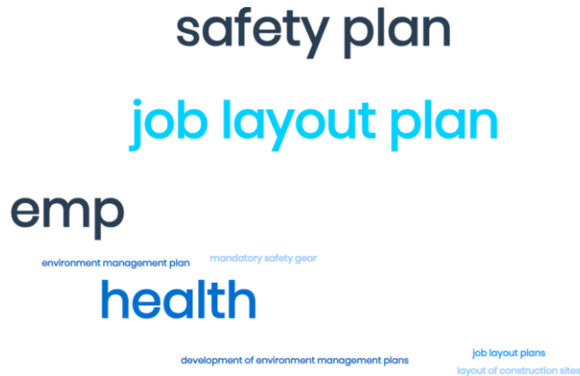
Figure 5. World cloud of FCDO's project under study on Environmental protection, health, and safety Provisions

DFID projects mandate adherence to provisions outlined in the Labor Act to protect workers' rights and promote fair labor practices (PPMO, 2019)