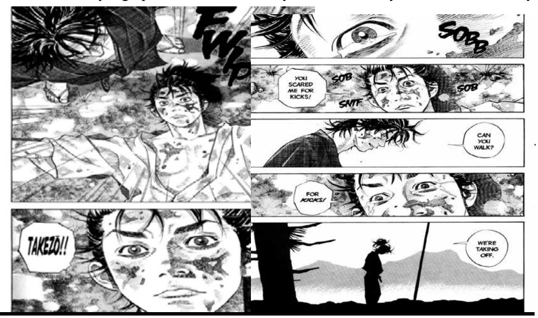
Matahachi and Takezo in the battlefield, and their expressions seeing each other alive ( Vagabond , vol.1, pp.12-13).

Essential Guide to World Comics provide substantial information on the history of graphic novels, typically since the 1700s....Perhaps one of the most distinctive features of today's graphic novels is that they self-consciously and self-referentially