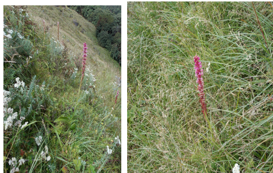
Figure 1: Satyrium nepalense var. ciliatum in its natural habitat

The study was conducted at Deorali pass, above Nangethati, Kaski. The study site is a large open meadow distributed from 2700 m - 3200m, and is located within the Annapurna Conservation Area. This meadow is extensively exploited by the local residents of Nangethati as a pasture land and harvesting grasses and other valuable herbs for their traditional subsistence.