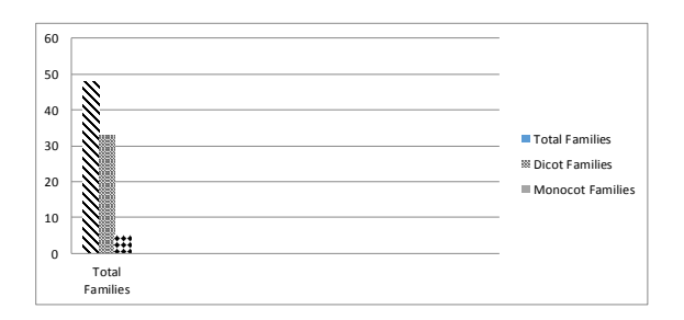
Fig. 2. Numbers of Families

Singh (2011) studied to analyze the seasonal vascular wall floristic composition of the Banaras Hindu University Campus, India. A total of 119 vascular wall floras were recorded. of which only one species was represented by Pteridophyte. No any species of Gymnosperm was observed as wall flora in the University Campus. Singh and Singh (2008) conducted a study to analyze the seasonal angiospermic wall floristic composition of city Buxar of state Bihar (India) covering the total land area of 24.7 km<sup>2</sup>. A total of 78 angiospermic wall floras were recorded. The angiospermic wall flora was represented by 64 genera belonging to 29 different families. Urban vascular flora and ecological characteristics of Kadikov district, Istanbul, Turkey was studied by Etem et. al. (2008). In this study, different kinds of urban habitats within the boundaries of Kadikov are described. A total of 561 vascular plant taxa were determined, wherein 412 (337 species, 44 subspecies and 31 varieties) were native and 149 (143 species and 6 varieties) were exotic and cultivated.