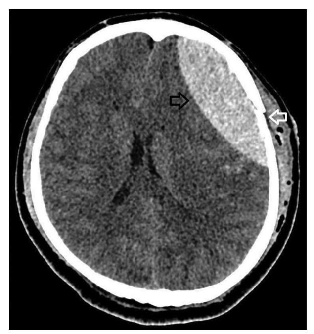
Figure 4: Non contrast CT head axial view demonstrates biconvex acute epidural haematoma in the left frontal convexity (black arrow). Associated left frontal bone fracture is also noted (white arrow).