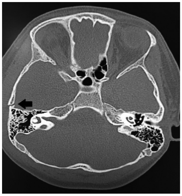
Figure 3: Non contrast CT head axial view bone window demonstrates linear fracture in right temporal bone (black arrow).