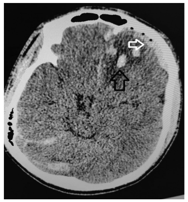
Figure 5: Non contrast CT head axial view brain window demonstrates multiple post traumatic contusions in the left frontal lobe (black arrow). Minimal adjacent subdural hematoma is also noted (white arrow).

Head trauma is a common encounter in day to day practice and even in this 21<sup>st</sup> century it continues to be a major public health concern. Globally, and especially in our part of the world, i.e. in south east Asia, it is on the rise<sup>5</sup>. It has been documented that incidence of head injuries is increasing mainly due to surge in usage of vehicles by low and middle