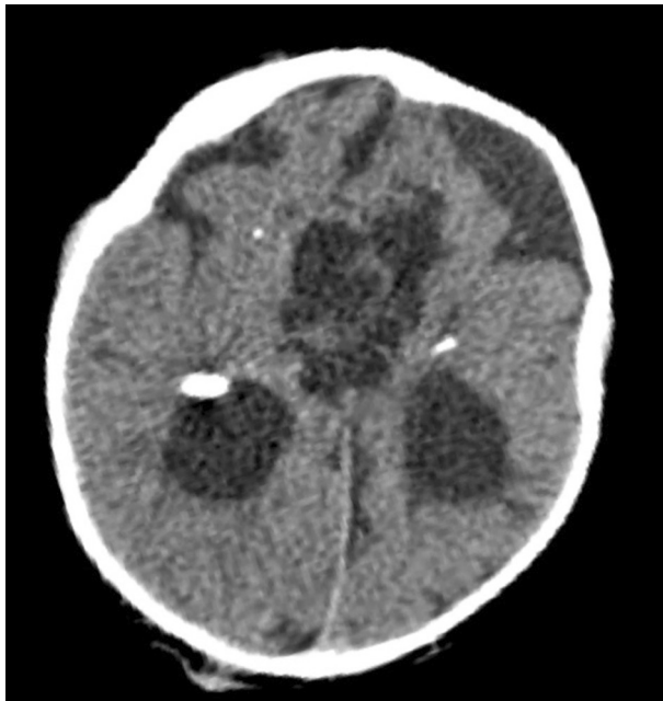
Figure 4: NCCT axial head at one month after VP shunting - Moderate dilatation of bilateral lateral and third ventricles, left frontal minimal subdural effusion seen – hydrocephalus ex-vacuo. Ventricular tips of VP shunt are seen on both sides. Compared to past scans, brain parenchymal volume has increased.

antibiotic unresponsiveness 5 . In such setting, NEL coupled with continuous CSF drainage system provides a conduit for clearing up the debris, and natural lavage. Many articles have shown higher rate of survival after NEL over antibiotic treatment alone for pyocephalus 2,5-9 . Schulz et al. described their experience in using NEL in 14 neonates. Among them 3 underwent NEL for antibiotic unresponsive ventriculitis. They found turbid CSF with pus/flakes attached to the ventricular wall intraoperatively similar to our case 10 .