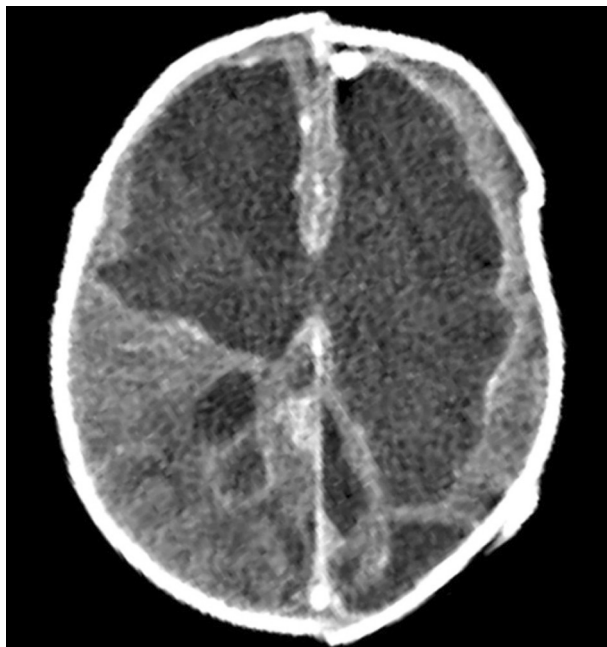
Figure 2: Axial CECT head - Gross dilatation of bilateral lateral ventricles. Thickening of the ependymal lining of the ventricles is seen which shows moderate enhancement in post contrast study. Marked compression with thinning of brain parenchyma is seen in bilateral frontal and left parietal lobe. Drain tube is seen in situ.

Plenty of cotton wool like pus/flakes could be seen attached to the walls of lateral ventricles. Detailed anatomy of lateral ventricle, choroid plexus