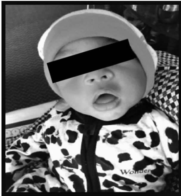
Figure 5: Child at 6 months of age

weight in order to gain better precondition for VP shunting as to say it has the secondary benefit to alleviate further VP shunt treatment 7,11 .