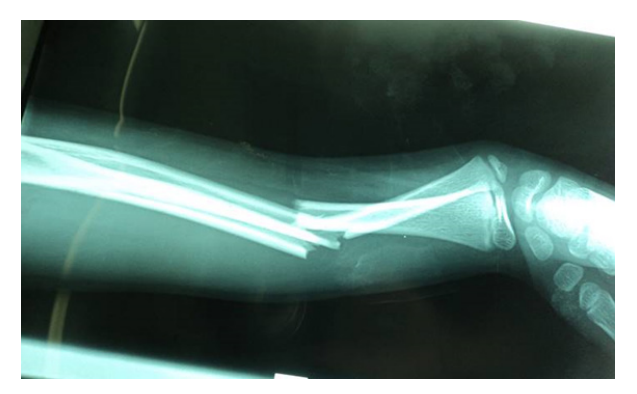
Figure 2: Displaced both bone fracture of forearm

Regarding the complications, skin irritation was most common 8 (10.2%) followed by paresthesia 5 (6.4%) and delayed union 4 (5.1%). There were 2 cases of malunion, one case of cortex perforation, one case of iatrogenic fracture at the time of surgery, one case of deep infection as shown in table 2. However, there was no single case of nonunion and neurovascular injury in our study.