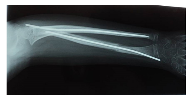
Figure 3: United both bone fractures six months after TEN

criteria. Around 91.02% patients had excellent outcomes, 6.4% patients had good outcomes and 2.6% patients had fair outcomes as shown in figure 1.