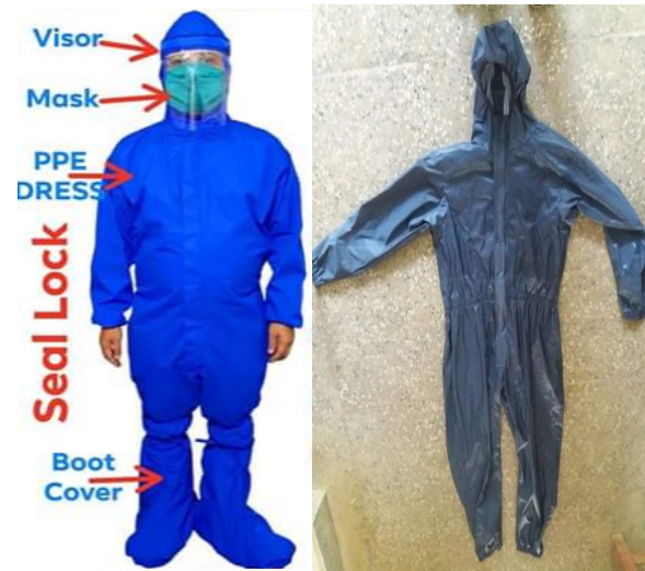
Figure 4: PPE Gown/Aprons

absent in many hospitals. Moreover; Nepal doesn't have own factories to produce standard PPE, needs to import from abroad. And there is a shortage of PPE in the world market. Donor countries can't respond because they are dealing with shortages themselves 11 . Several healthcare workers (HCWs) in England have told the BBC news of a lack of equipment in their hospitals. HCWs are designing PPE from clinical waste bags, plastic aprons and borrowed skiing goggles 20 .