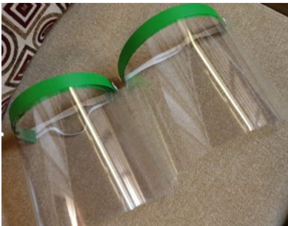
Figure 9: Face Shield

aggressive buying, since the end of January, UNICEF has effectively secured 7.4 million surgical masks, 4 million respirators, 2.2 million surgical gowns, 1.8 million coveralls, aprons and 11,600 infrared thermometers, among numerous items, a portion of which has already been delivered to countries. And UNICEF is engaged with 1000 suppliers to find a solution to current market demand. 21