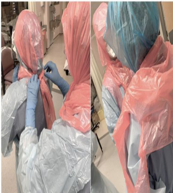
Figure 3: The NHS workers wearing bin bags as protection

Recently, PPE shortages are posing a huge challenge to the healthcare framework around the world because of the COVID-19 pandemic. Healthcare offices are facing trouble getting to the required PPE and are having difficulty identifying alternate ways to provide patient care 7, 8 . Nepal is ahead of the curve, but if the corona caseload is to rise steeply as it has done in Italy or Spain, The Nepal government needs to arrange alternatives 8 . Nepal has entered into the second phase of the outbreak, with the confirmation of the first locally transmitted COVID-19 case in Nepal, epidemiologists have cautioned that the case could be a sign of a possible outbreak of the dangerous illness within the nation 9 . Nepal has a total of thirty active cases of COVID-19, while two patients have already recovered from the virus (17 April 2020) 10,19 . At present, nurses, doctors, interns and resident doctors and other medical personnel in Nepal's hospitals lack personal protective equipment (PPE), and they fear for their own lives while treating patients with suspected coronavirus 8 . Patients can be carriers and spreaders of the virus without showing any symptoms. Thousands have been visiting hospitals to get tested, have chest x-rays done, and could be unknowingly infecting medical staffs and other patients. Healthcare workers in Nepal are stressed because PPE supplies are limited. running low. or