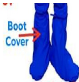
Fig.5: Goggles & Helmet Fig. 6: Boots/ footwear