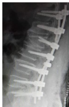
Figure 3: x-ray L-S spine lateral view with OVF showing long segment pedicle fixation

The patients were treated on an OPD basis. Out of the 158 patients, 140 (72%) were managed conservatively and 18(11.3%) surgically. Pain was treated with NSAIDS (Non-steroidal Anti-inflammatory Drugs), bed rest during acute and severe pain, thoraco-lumbar brace for 3 weeks. Opioids (Tramadol) were used in cases unresponsive to NSAIDS. Physiotherapy was started when the acute pain subsided. Depending on the BMD report, tab Alendronate was started (70mg once a week) for osteopenia and osteoporosis and followed with repeat BMD every 3 months. Teriparatide was used in those with severe pain and osteoporosis for 1 month and monitored using BMD. Tab Calcium (500mg twice a day) and Vitamin D3 (60000 IU once a week) was given in those who had low levels in blood and monitored with repeated blood tests. 44 patients with severe and unresponsive pain, significant deformity and neurological deficits were advised for surgical intervention. Since the facility of Vertebral Augmentation is not available, these patients were offered surgery. However, only 18 (11.4%) of these agreed for surgery. They underwent decompression and long segment fixation and fusion (Figure 3). Postoperatively, they were continued on anti-osteoporotic drug (Alendronate), Calcium and Vitamin D3. The brace was continued for 6 weeks, and physiotherapy was started as soon as the postoperative pain got subsided.