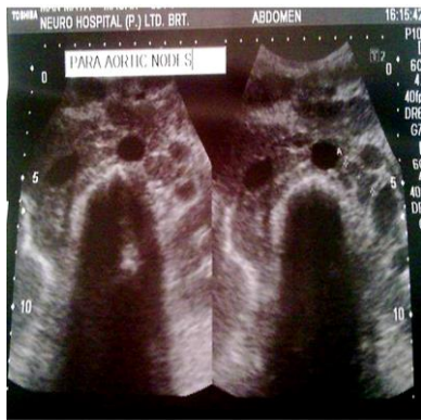
Figure 2: Ultrasound showing large bilateral multiple matted paraaortic lymph nodes.

She was being planned for fine needle aspiration (FNAC) of the frontal mass and also CT guided aspiration of the thoracic mass when she complained of diarrhea with severe pain abdomen. Per abdomen examination revealed multiple firm intraabdominal masses, non-tender, partially mobile with no hepatosplenomegaly. Ultrasound revealed multiple matted para-aortic masses and nodes along the iliac and femoral vessels (Figure 2).