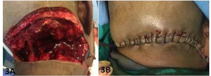
Figure 3A, 3B: Primary Closure (PC) was done for large occipital cut injury