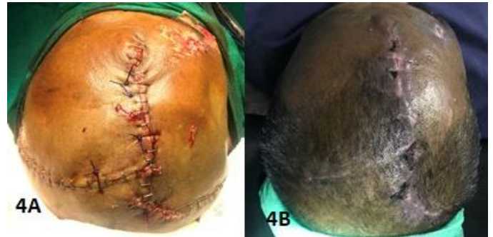
Figure 4A, 4B: After surgery and removal of suture, of a large frontoparietal scalp defect treated with local advancement flap (AF) with galae scoring