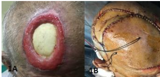
Figure 1A, 1B: A large frontal scalp defect with exposed bone treated with flap rotation and split thickness skin graft (STSG).

trauma to scalp. Patients, who had major tissue loss with exposure of scalp bone, were treated with local reconstruction as well as Split Thickness Skin Grafts (STSG), (Figure 1A, 1B). Scalp lacerations lacking approximation or tissue loss were repaired with flap rotation with different methods like Z-plasty, Pinwheel flap technique etc. (Figure 2A, 2B). Primary Closure(PC) was done with proper debridement and approximation of both scalp margins (Figure 3A, 3B). Advancement of Flap (AF) and Flap Rotation(FR) were done in the cases, lacking approximation and significant tissue loss. In the advancement of flaps, the margins of the wounds were advanced either one or both sides, and undermining with galea scoring was done where needed (Figure 4A, 4B). While doing reconstruction, the major arterial supply of the scalp was preserved to maintain vascular supply to the reconstructed site in order to have good wound healing. Thus, operated cases were collected and non-probability purposive sampling technique was used. The cases were stratified with mode of injury, type of reconstruction done and complications, then processed in IBM SPSS version 23.