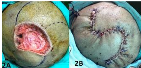
Figure 2A,2B: Rotation flap (FR) with O-Z Plasty was done to reconstruct the parietal scalp defect