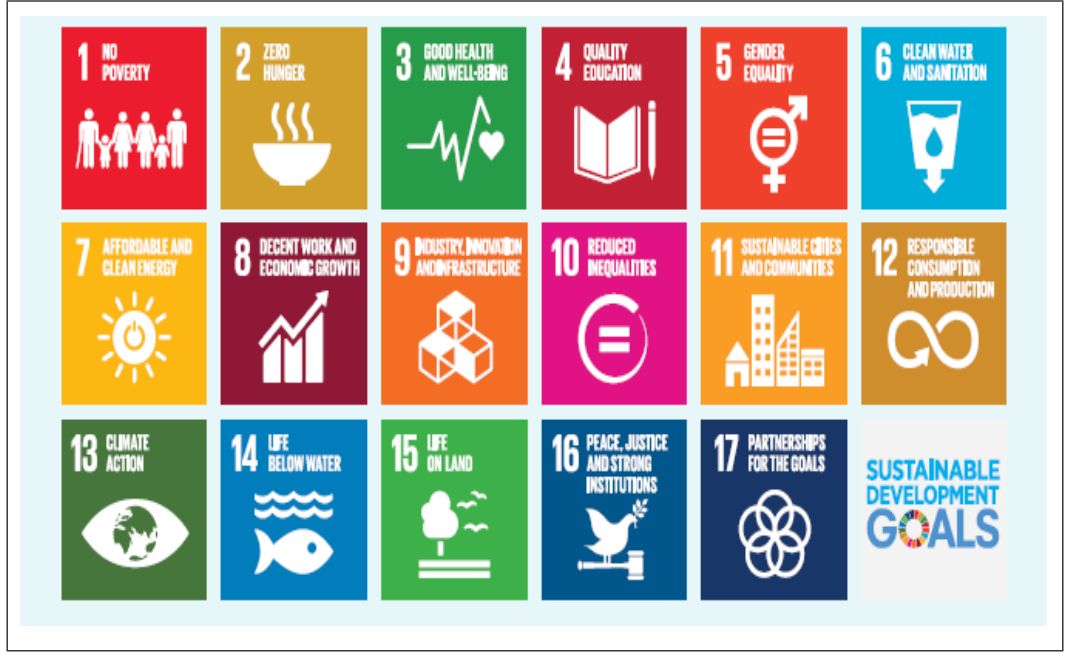
Figure 1: 17 agendas of United Nations Sustainable Development Goals, Source: UN 2015, https://www.un.org/sustainabledevelopment/sustainable-development-goals/

The SDGs have been well-integrated into Nepal's national development framework. Nepal has developed the SDGs status and roadmap 2016-2030, SDGs needs assessment, costing and financing strategy, and SDGs localization guidelines that spell out baselines, targets and implementation and financing strategies for each SDG. Nepal has made commendable efforts for the implementation of the SDGs since its adoption. However, different calamities, disasters and the circumstances that