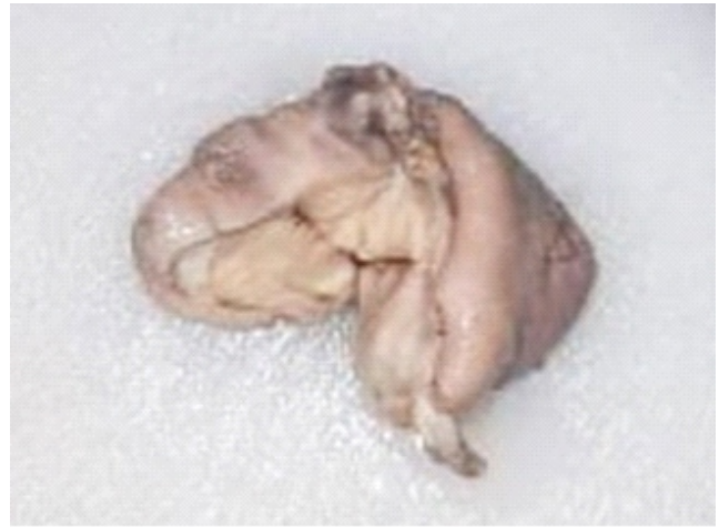
Figure 1: Gross photo of gastric tissue with grey brown mass

Laparoscopic assisted and wedge resection of the tumour showed a 3x3 cm well-circumscribed soft to firm mass present in a lesser curvature of the cardia of the stomach region subserosal in position with no ulceration. A sample was sent for histopathological examination, where it was found to have a subserosal growth in the stomach measuring 3x2x1.5 cm (Figure 1). The cut section was grey or brown in color. Attachment to the normal gastric mucosa was also identified. The microscopic examination of the mass revealed the presence of pancreatic duct acini and connective tissue in the gastric muscularis propria and serosal layer. There was a predominance of benign proliferation of the exocrine portion of the pancreas only (Figure 2). The overlying gastric mucosa and submucosa show the presence of gastric fundic glands, which were histologically unremarkable and showed few chronic inflammatory cells infiltrated (Figure 3).