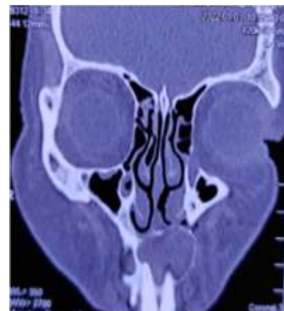
Figure 3: CT paranasal sinus of radicular cyst