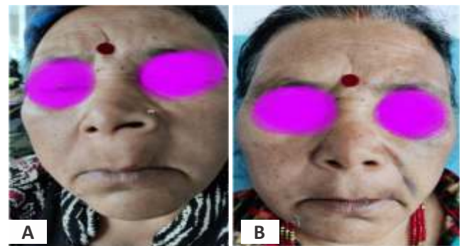
Figure 1: A. upper labial region swelling preoperatively B. postoperative removal of swelling

maxilla. After a cystic rupture, a brownish viscous fluid came out. The endoscope was used to visualize the entire dissection and separation of the cyst from the bony wall(Figure. 4B).It was completely removed and cyst was found 4*4.5 cm dimension (Figure. 5A&B).As there was also deviated nasal septum of the patient, endoscopic septoplasty was performed. The nose was packed with a merocel. The dead space made after cyst removal was packed with antibiotics impregnated ribbon gauze and removed at 5 th POD.The patient was discharged at the 7th POD without any complaint(Figure. 1B).The postoperative healing phase remained uneventful. Histopathology revealed cystic structure lined by stratified squamous epithelium with granulation tissue and stroma containing dense acute and chronic inflammatory cells (Figure.6&7). On one month follow-up, the patient was quite pleased and satisfied, and the cyst had not recurred.