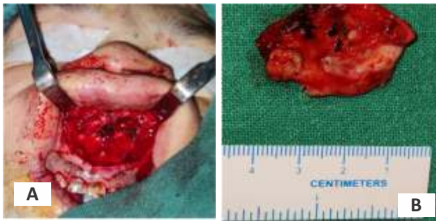
Figure 5: A. Intraoperative cystic cavity and B. Excised radicular cyst