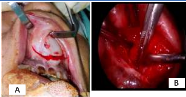
Figure 4: A. Sublabial mini-visor incision and flap elevation B. endoscopic cyst dissection.