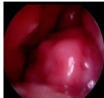
Figure 2: Showing elevation of left nasal cavity floor on endoscopic examination.