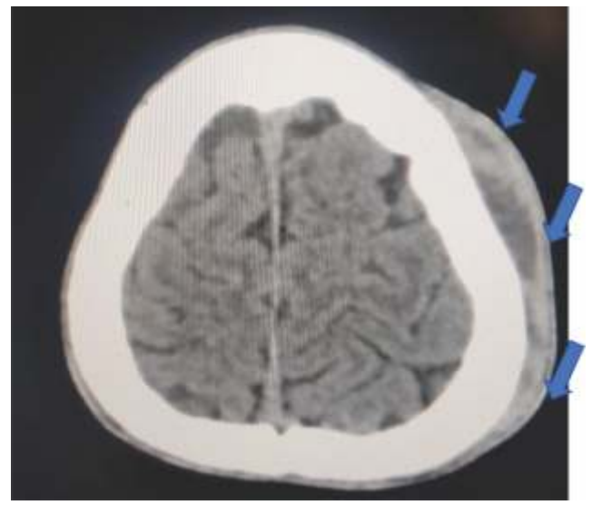
Figure 2. Axial section NCCT scan showing marked scalp soft tissue swelling (thick arrows) with scalp hematoma in left frontoparietal regions

Birat Journal of Health Sciences Vol. 6, No. 1, Issue 14, Jan-Apr 2021