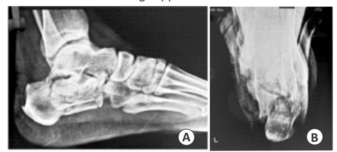
Figure.1. Pre-operative X-rays of calcaneal fracture.(A) Lateral views showing intra-articular fracture of calcaneum with Bohler's angle of 4 degree and Gissane angle of 138 degree. (B) Axial view showingvarus, decrease in height and widening of calcaneum.

obtained(fig.1). CT scan and 3-dimensional(3D) reconstruction were performed to see details and to classify fracture based on sanders classification(fig.2.).<sup>10</sup> The limb was immobilized in short posterior slab, elevated and ice pack was applied to decrease swelling. Surgery was done, once swelling decreased and wrinkle sign appeared.