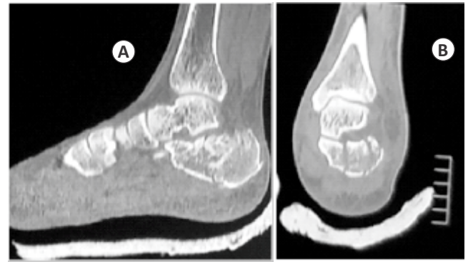
Figure 2: Preoperative CT scan of calcaneal fracture. (A) saggital section of calcaneum. (B) coronal section through posterior facet showing sander's type III calcaneum fracture.