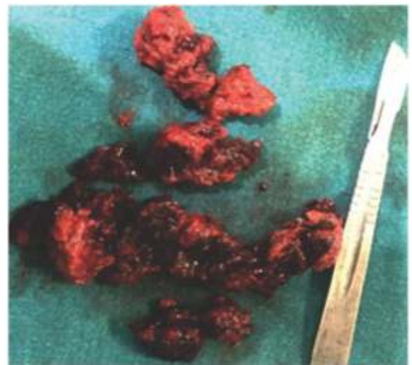
Figure 2: Excised necrotic growth