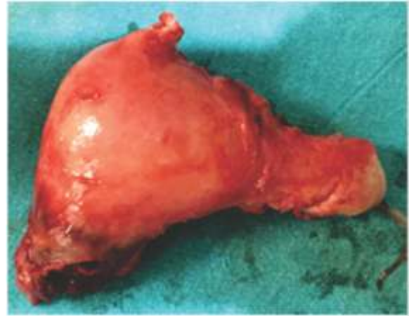
Figure 1: The uterus with necrotic and hemorrhagic growth in the rt cornua

clot. The Blood clot was evacuated and DJ stenting along with suprapubic catheterization was done. Histopathological examination report revealed Choriocarcinoma (figure 4). Patient falls under low risk on WHO prognostic scoring, so she was started with single cycle chemotherapy with Methotrexate and Folinic acid. Patient had completed her 5 th cycle of single agent Chemotherapy and is under regular follow up with serial \beta HCG level.