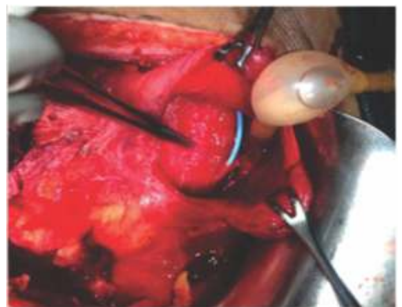
Figure 3: Intraoperative cystostomy with DJ sent in situ