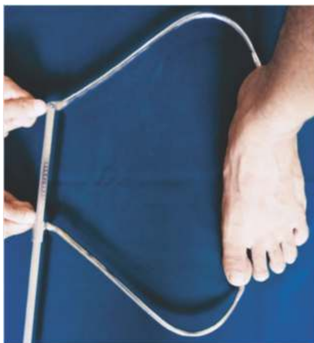
Figure 1: Measurement of foot length

A small group of students were taken for measurements each day at a fixed time between (11:00 am to 2:00 pm) to avoid diurnal variation and single observer conducted the measurements. The data obtained were entered in MS excel and analysed by SPSS (Statistical package for Social Sciences). The t test and Pearson Correlation was used to calculate p value.