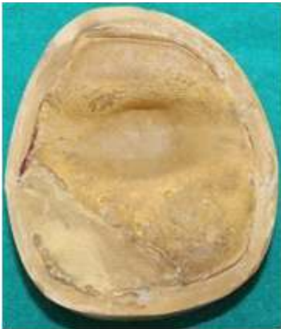
Figure 2: Working cast

distant gaze. The measurements were recorded and transferred on to the master cast. Sclera pattern was also fabricated with the help of modeling wax and acrylized in a conventional manner. Sclera was tried in patient and iris orientation was done by asking the patient to look and fix the contralateral eye at distant gaze and by measuring the contralateral iris. Iris painting was done to match the contralateral side, completing the fabrication of the ocular portion of orbital prosthesis.