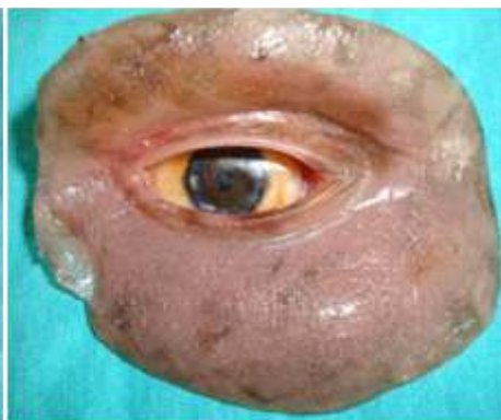
Figure 13: Prosthesis after extrinsic color