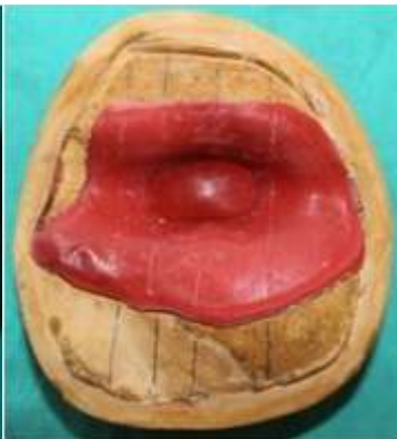
Figure 5: Sclera orientation