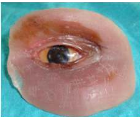
Figure 12: Prosthesis after intrinsic color