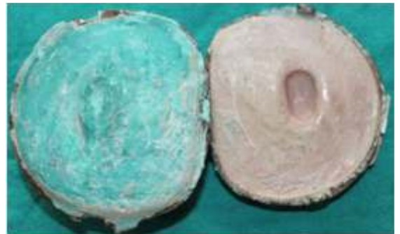
Figure 6: Dewaxing