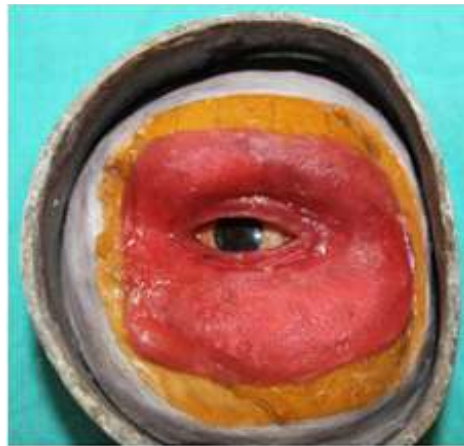
Figure 10: Flasking