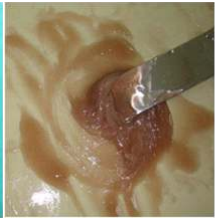
Figure 11: Coloration