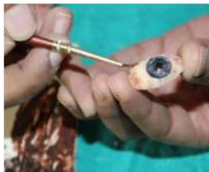
Figure 8: Eye painting