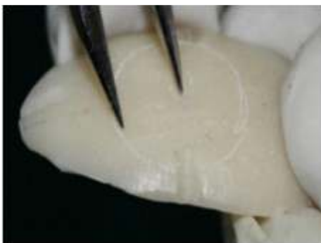
Figure 7: Iris orientation