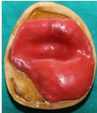
Figure 3: Wax pattern