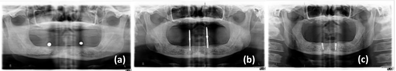
Figure 4. Orthopantomograph with ball bearings in place B and D location, assessment of relative parallelism between performed osteotomy after initial pilot drill (b), after implants insertion (c).

compared to maxilla, puts mandibular denture into a compromised position and at bay with retention and stability. 2 A number of modified impression technique have been described for resorbed mandibular ridges by various authors, such as admixed, functional relined, All-green and cocktail technique conferring better retention and stability to dentures as compared to dentures fabricated by conventional technique. 3-7 In this case, an analogue for mandibular denture bearing area was obtained using cocktail impression technique and subsequently rehabilitated in accordance to the York consensus statement underpinning two implants supported mandibular overdenture as the first choice of standard of care for mandibular edentulous patients. 8 Various attachment system have been discussed in scientific literature to connect implants with overdenture. 9 Yen et.al and Jain et.al have used locator attachment system to connect non-splinted implants with mandibular overdenture. 10,11 In this case a ball and socket attachment