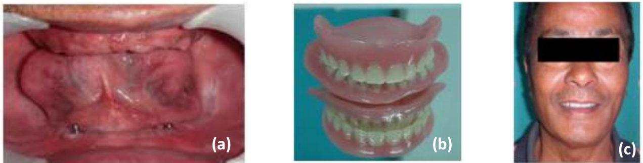
Figure 5: Ball attachment in place (a), Complete denture (b), Rehabilitation with implant supported mandibular overdenture

The abutment site was marked intraorally with an indelible pencil and these markings were transferred to the lower denture. The denture was relieved in the marked area and direct method of attachment of nylon plastic cap with lower denture was used. The fit of the lower denture with nylons caps were evaluated. Patient was recalled after 1 week, 3 weeks, 3 months and 6 months for further evaluation.