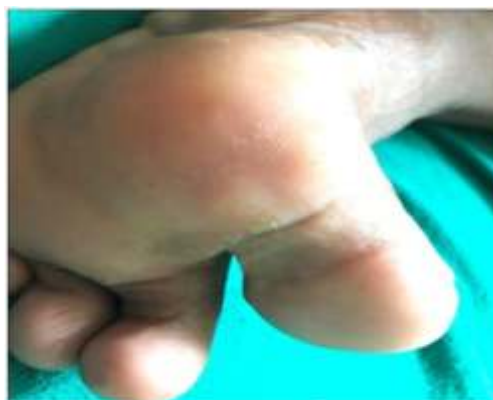
After 4 sessions of therapy

cells to circulate all over the body and helps in clearance of the distant non injected warts as well. 10