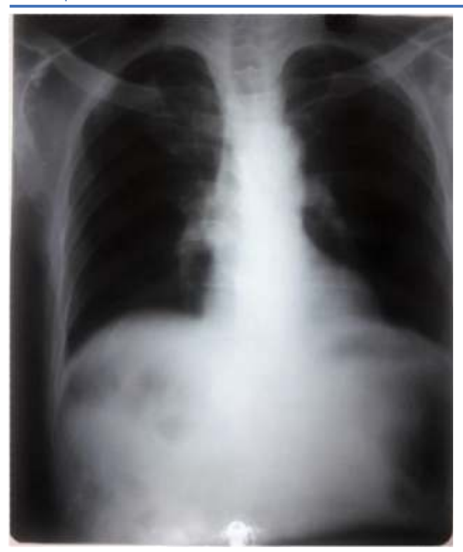
Figure 3: Resolution of right subdiaphragmatic lucency after 72 hours.