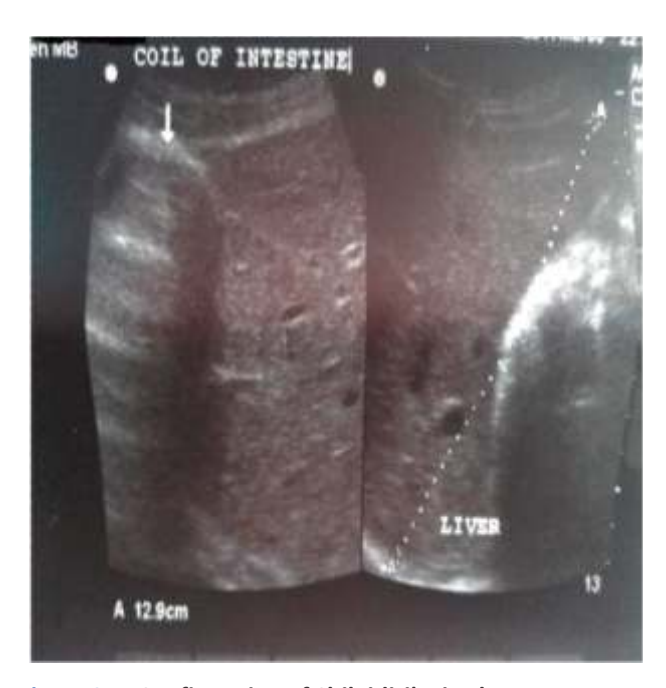
Figure 2: Confirmation of Chilaiditi's sign by ultrasonogram.