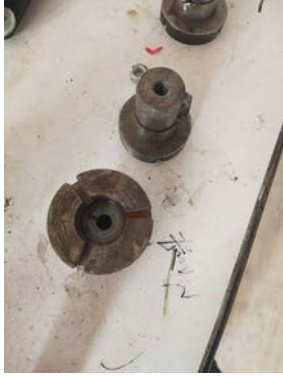
Figure 2. Custom iron shaft

Custom Shaft: Custom iron shaft needed for holding the motor strongly is completed ( Figure 2 ).