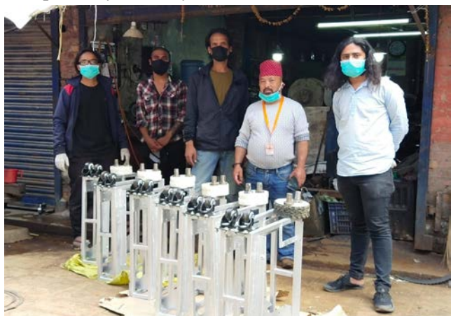
Figure 1. The base of Robot is made from Iron for motor mounting where the iron plate is welded and the wheel is attached to it . Electronics components are also placed safely in the base compartment. Metal Framework was completed on May 16. For the hardware part assembly of base and upper part was completed by 19 th May 2020.

Metal Framework: The base of Robot is made from Iron for motor mounting where the iron plate is welded and the wheel is attached to it . Electronics components are also placed safely in the base compartment. Metal Framework was completed on May 16. For the hardware part assembly of base and upper part was completed by 19 th May 2020 ( Figure 1 ).