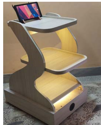
Figure 6. Design of robot

f) Design of Robot: The robot is designed with elegant look and efficient use ( Figure 6 ).