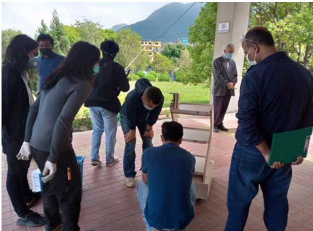
Figure 3. Motor testing

Motor Testing: Testing of Motors for all six robots were completed and working completely fine. Fixing of the motor was completed by 25 th May 2020 ( Figure 3 ).