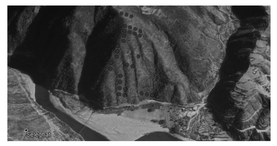
Fig 2: Study site with sampling plots