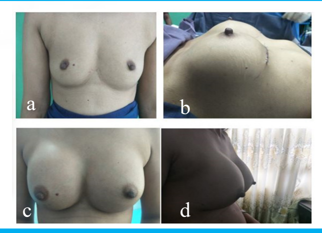
Figure B: 36 years old with primary breast agumentation with smooth silicon implant. Preoperative front view(a) postoperative immediate lateral view(b), front(c) and lateral(d) view at 18 months of postoperative with maintainance of IMF position.

Figure A: 32 years old with primary breast agumentation with smooth silicon implant Preoperative inframammry incision marking(a), postoperative immediate lateral view(b), front(c) and lateral(d) view of postoperative at two years with IMF stable.