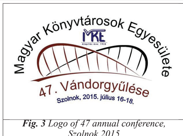
Fig. 3 Logo of 47 annual conference, Szolnok 2015