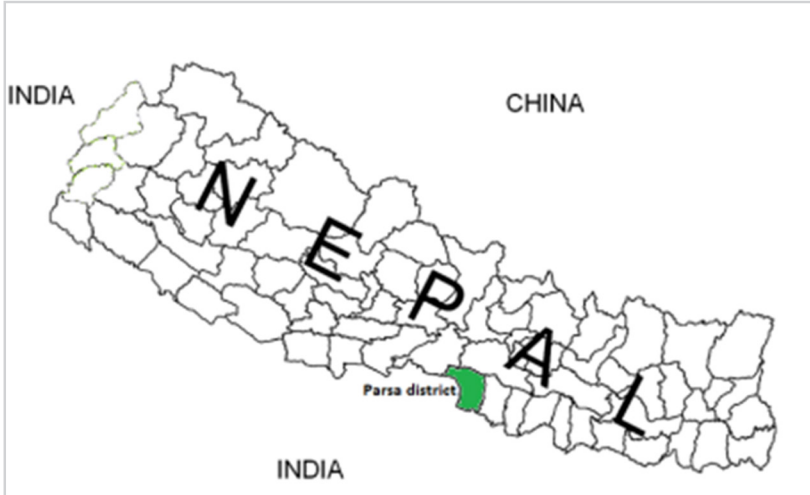
Figure 1 a. Map of study area

1 a. & Figure 1 b.). The typical vegetation of this area is tropical forest types dominated by Shorea robusta , Acacia catechu and Dalbergia sissoo .