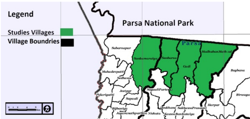
Figure 1 b. Map of studied villages