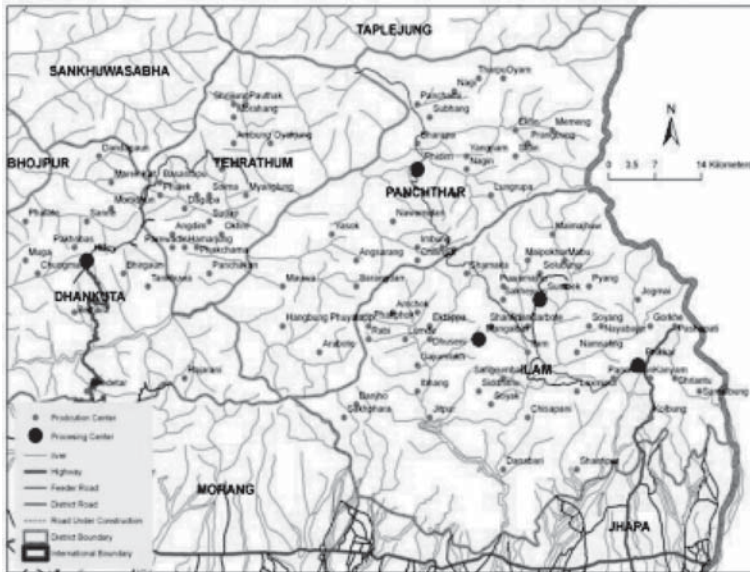
Figure 3: Market Centers of Tea Sector

information, training and services and knowledge of marketing prices. This illustrates the very real geographical disadvantage of the more remote growers.