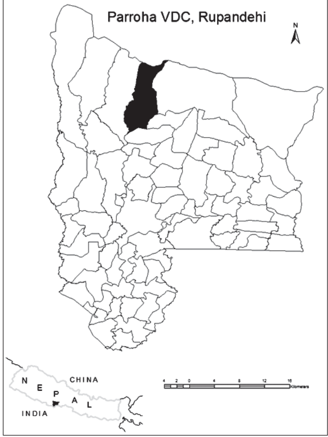
Figure 1. Map of the study area.

Parroha VDC is located in Rupandehi district which lies between 27°20' to 27°45'N latitude and 83°10' to 83°30'E longitude. It is a part of the Terai region of Nepal and covers a total area of 73196.1 ha<sup>2</sup> of which about 73% is agricultural land, urban areas, and roads, 23% forest, and the remaining 4% water resources (Anonymous, 2007). Present research was conducted in Parroha Community Forest of Parroha VDC with an area of 633 ha and lies in churia range of Nepal. The total population of VDC is about 20,000, of which about one fourth are Tharu (CBS 2002). The altitude of the district ranges from 220 m to 500 m a.s.l. The forest is mainly dominated by Sal (Shorea robutsa) with its associated species like Saj (Terminalia alata), Banjhi (Anogeissus latifolia) etc. The climate of the area is typically tropical dominated by the southeast monsoon. A hot climate generally prevails throughout the year except in the short winter. The temperature ranges from an average of 7°C in winter to an average of 45°C during summer.