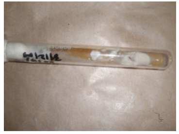
Figure 1: Culture growth of Sporothrix schenkii

Reports of fungal culture: After 7 days of incubation at 37°C and 25°C in Brain heart infusion (BHI) blood agar and Saburouse detrose again (SDA) respectively, growth of fungus was noted. At 25°C, colonies were white, moist and glabrous, with a wrinkled and folded surface (Figure 1). Slide culture was done from growth. Lacto pheno catfon blue (LPCB) preparation from slide culture showed conidiophores at right angles from the thin septate hyphae. Conidia were formed in clusters as their arrangement suggesting a flower. Conidia were ovoid (3-6 x 2-3 um in size) and hyaline (Figure 2).