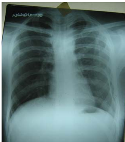
Fig-4 X-ray of chest showing left sided mild pneumothorax