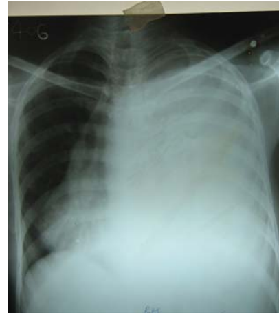
Fig. 1: X-ray of chest showing homogenous opacity left side of chest with shifting of mediastinum to right side.

The study has been approved by institutional review board. After obtaining the informed consent, we gave