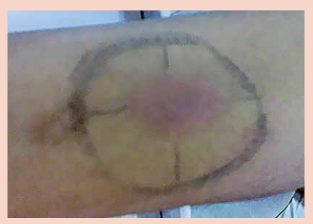
Figure 2: Positive induration of MT