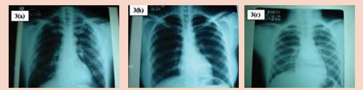
Figure 3: Chest X ray of Father (a), Mother(b) and Brother(c)