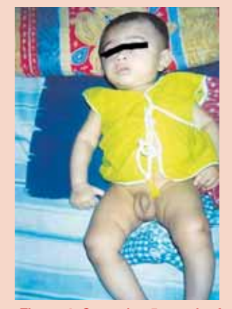
Figure 4: Sayeed at 5 month of age (During admission & before treatment)