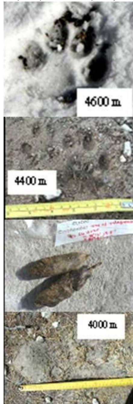
Figure 2. Pugmarks (1 st and 2 nd ), pellets (3 rd ) and scarp (4 th ) observed in Langtang area.

Langtang experiences (Khatiwada and Chalise, 2006; Sharma et al. , 2006).