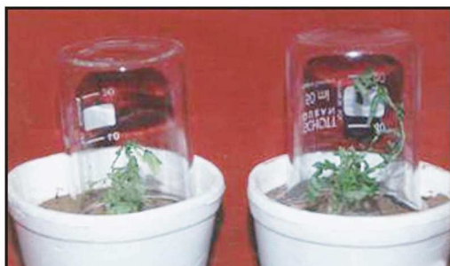
Figure 4. Hardening and acclimatization of regenerated plants

In vitro raised plantlets were taken out from the culture bottle and hardening and acclimatization was done by the method described in “Materials and Methods” (Figure 4).