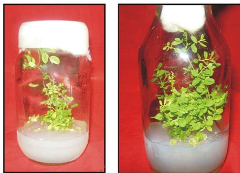
Figure 1. Multiplication and elongation of Phyllanthus amarus shoot on MS medium supplemented with BAP 0.5 mg/l.

reported in other plant species like Costus speciosus , (Robinson et al. , 2009) and Baliospermum montanum (Sasikumar et al. , 2009) on the same medium in which they were initiated. However, in contrast to the multiplication medium, Datta et al. (2007) reported elongation of shoots on MS medium having different growth regulators in Jatropha curcas . After elongation, in vitro flowering was also observed in few shoots on the same medium incorporated with BAP (0.5 mg/l) (Figure 2).