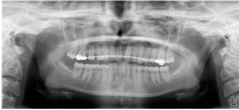
Fig. 11 Post distalization orthopantamogram