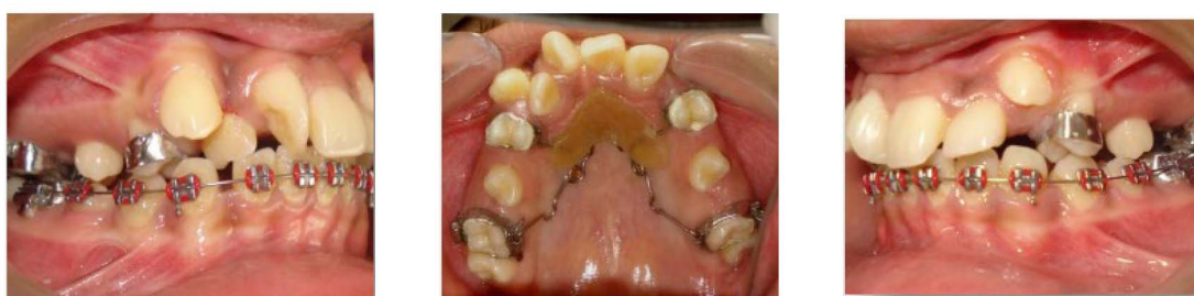
Fig. 3 Post distalization photographs