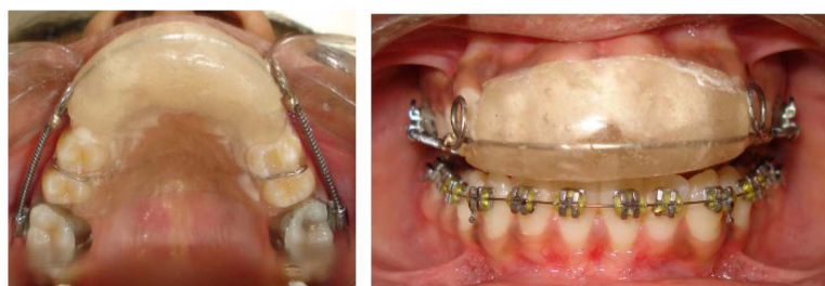
Fig. 19 Post distalization photographs