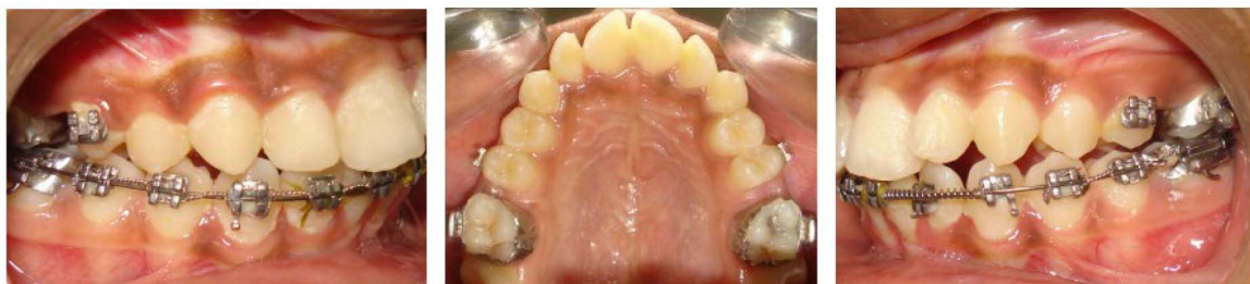
Fig. 18 C- space regainer