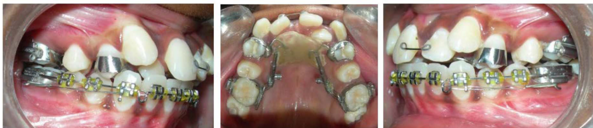
Fig. 7 Post distalization photographs