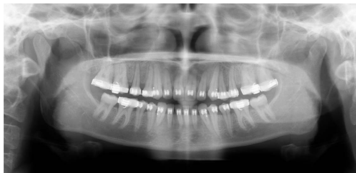
Fig. 15 Post distalization orthopantomogram