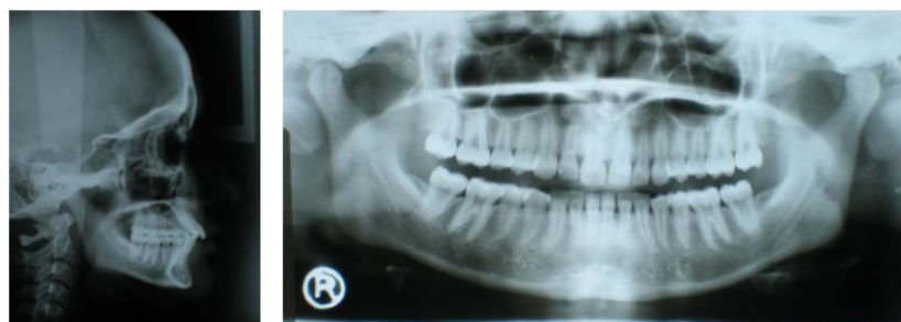
Fig. 9 Pre-treatment lateral cephalogram and orthopantomogram