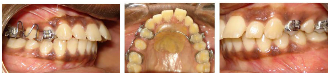
Fig. 10 Post distalization photographs