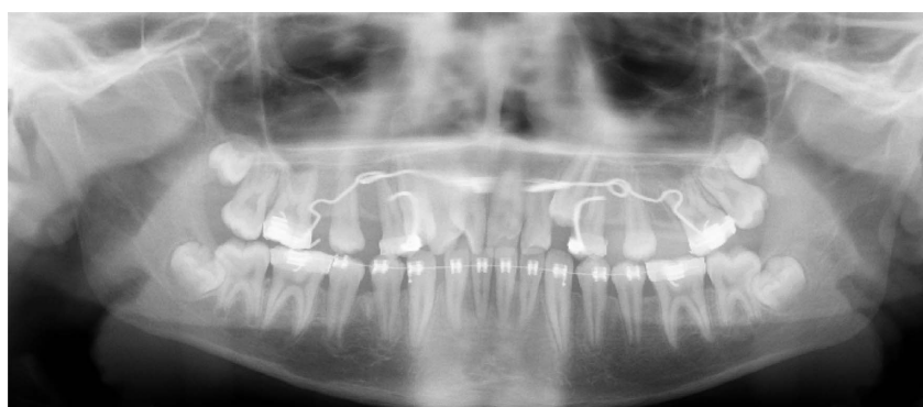
Fig. 4 Post distalization orthopantomogram