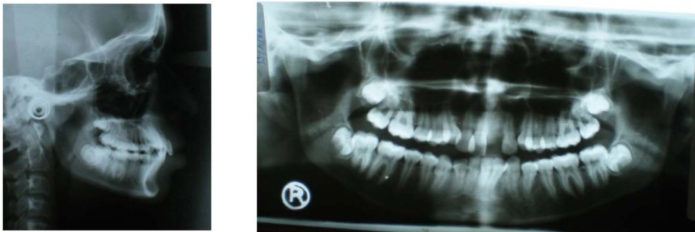
Fig. 6 Pre-treatment lateral cephalogram and orthopantomogram