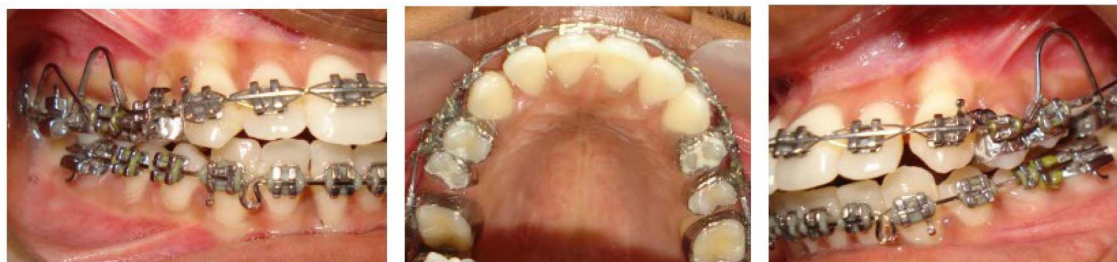
Fig. 14 Post distalization photographs