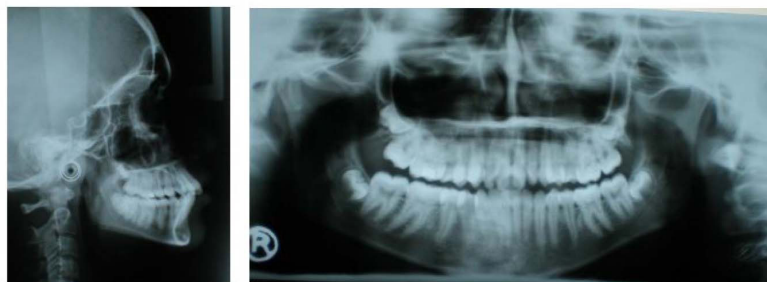
Fig. 17 Pre-treatment lateral cephalogram and orthopantomogram