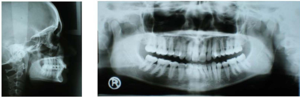
Fig. 13 Pre-treatment lateral cephalogram and orthopantomogram