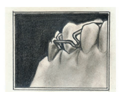
Figure 5 B

Figure 5: Modified arrowhead clasp. A: Front view, B: Lateral view (Redrawn from: Adams CP. The retention of removable appliances with the modified arrowhead clasp).<sup>18</sup>