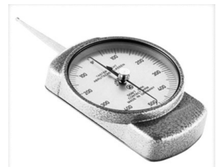
Figure 2: Tension gauge