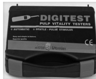
Figure 1: Electric Pulp tester

A total of 71 patients with mesially tilted molars who needed molars to be uprighted as a part of orthodontic treatment were selected as sampling frame from the Orthodontic Department, University of the East, Manila, Philippines. Since pain threshold is dependent on multiple factors; Digitest electric pulp tester (model 628D, USA) (Figure 1) was used to calibrate the level of pain threshold.