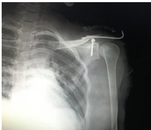
Figure 3. Postoperative radiograph showing fixation clavicle by K wires and glenoid fracture fixation with cannulated screw.