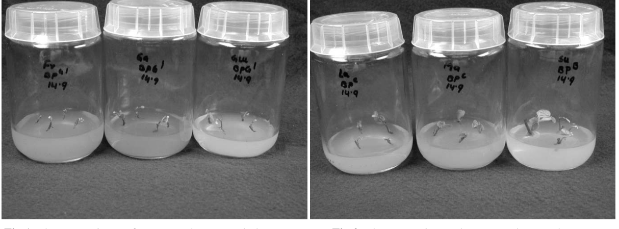
Fig.1. Plants growing on fructose, galactose and glucose

Relatively few scientists have tested different sugars. The effect of sugars on B. purpurea was apparently seen that sucrose was found the most effective followed by maltose, glucose, galactose, lactose and fructose.