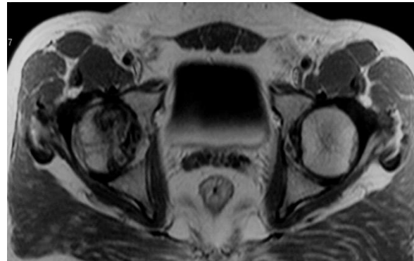
Fig 2: T1-weighted axial MR image showing serpiginous high signal area with low signal periphery in the subchondral region of the right femoral head.

caissons disease, systemic lupus erythematosus, vasculitis, sickle cell anemia, coagulopathies, fat embolus syndrome, Gaucher's disease, chemotherapy and/or radiation, organ transplantation, chronic liver disease, etc. 2, 3 A cause for avascular necrosis is not identified in about 25% of cases.