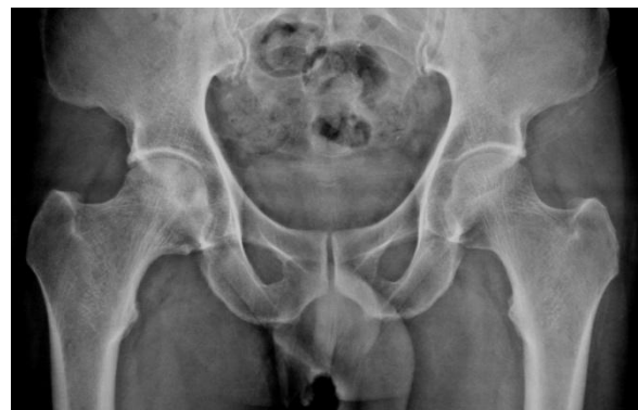
Fig 1: Plain radiograph of hip joint showing sclerosis and subchondral lucency in the right femoral head.

certain cases, genetic factors, such as mutations in the COL2A1 gene, have been associated with the pathogenesis of osteonecrosis. 5 Males are affected up to three times more than females, and bilateral femoral head osteonecrosis is found in up to